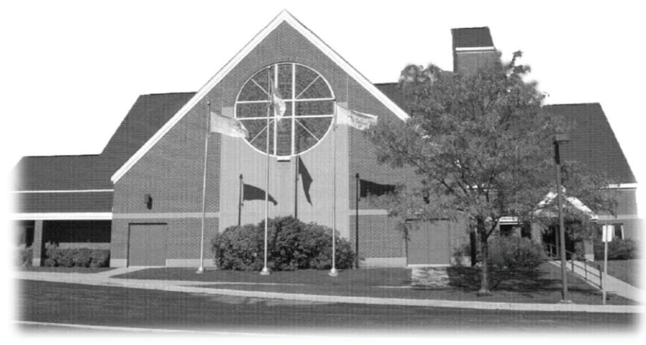
"... The seed is sprouting and growing ..." (Mark 4:27)

Wednesdays & <u>First</u> Fridays 11:00 - 11:45 AM Saturdays 4:15 - 4:45 PM or by appointment